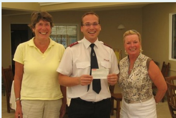
The Ladies section present cheques to their chosen charities:- The Salvation Army and Riding for the Disabled