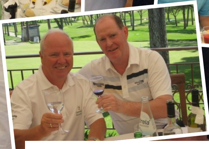
The Ben Hogan Trophy – Pinheiros Altos V Quinta do Lago