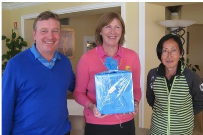
Ladies Past Captain's Day