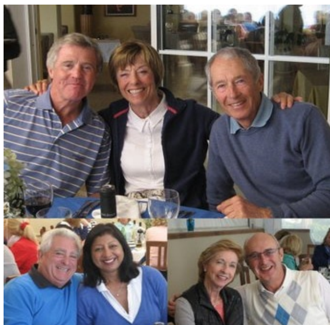
Captains' Drive-In lunch