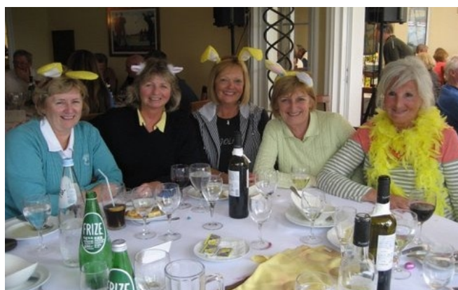
what do you call a group of bunnies?