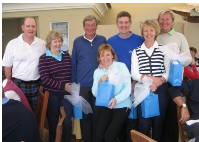
Cross Country winners