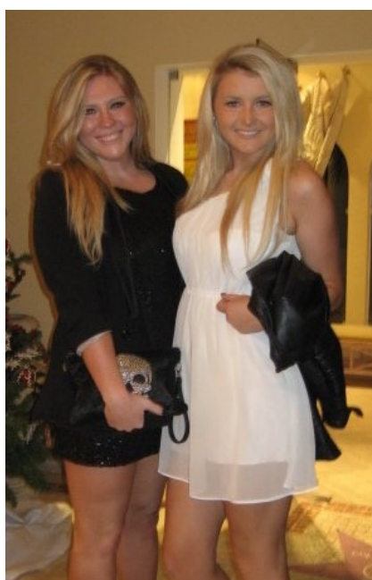
The Bond girls