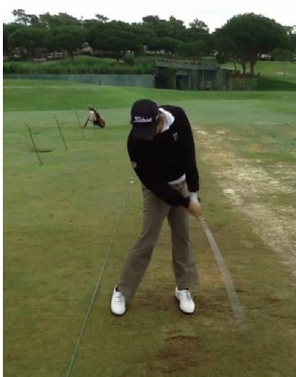
Just after impact and again great resistance this time from the left side and the steady head as the arms swing through the ball.