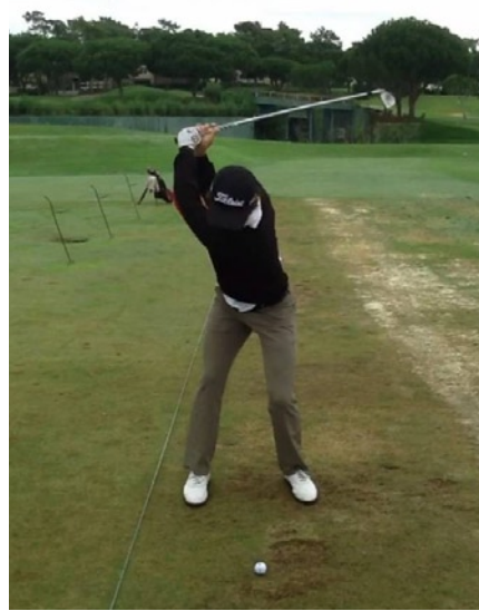
Top of backswing – great resistance in the right side while the shoulders turn, coiling the core into a powerful position. Notice how relaxed the arms look, ready to lag in the downswing.