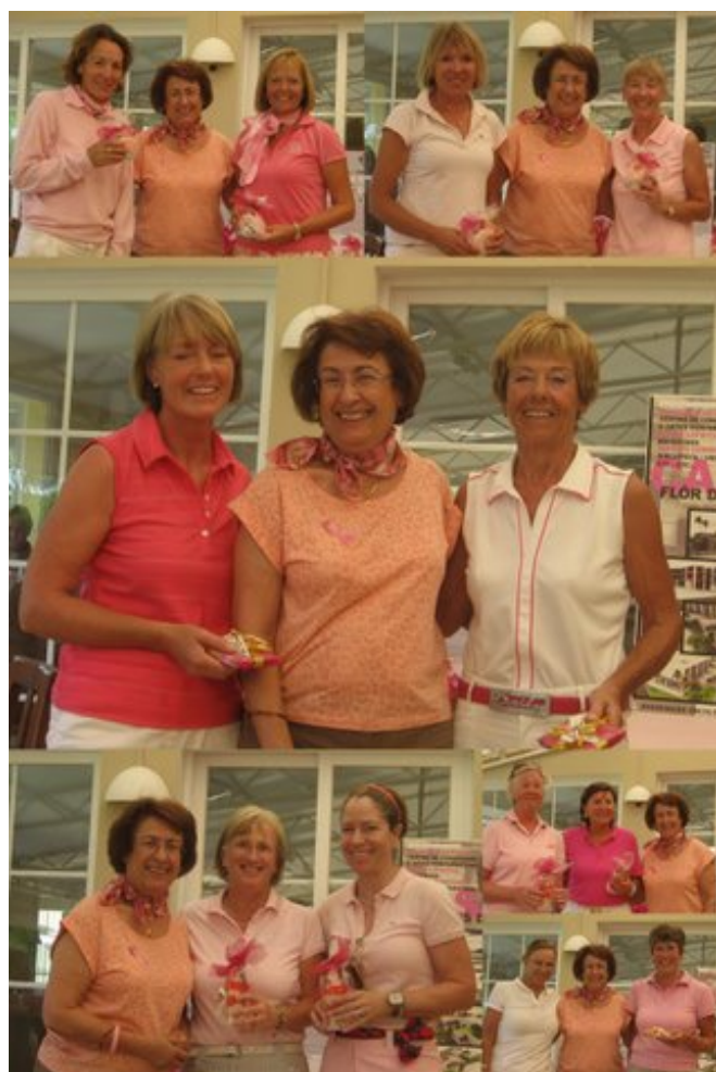
Views of Pink Day

A few days later we had the Ladies dinner where the prize winners of the Eclectic Competition were announced. In the morning was a Stableford competition and in the evening there were 32 beautifully dressed ladies in the clubhouse to enjoy their evening. Again there were raffles for charity and luckily we had found sponsors to give some extremely nice vouchers, so we were able to raise 650 Euros. Very generous ladies!!!