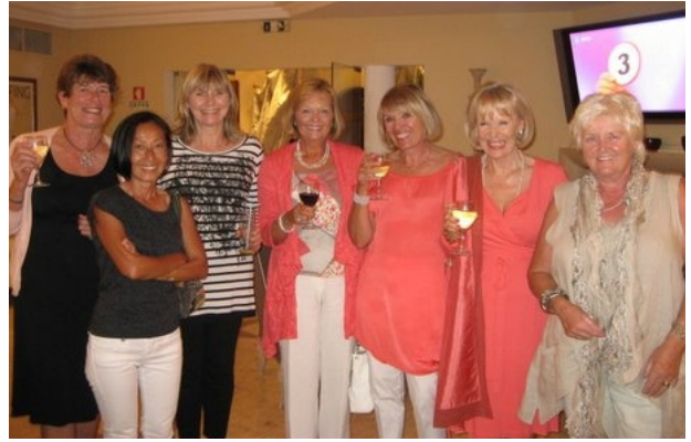
The defeated ladies stick together!