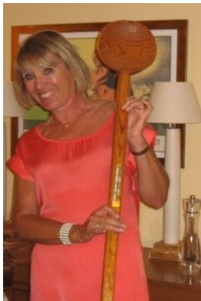
The trophy no Captain likes to win!