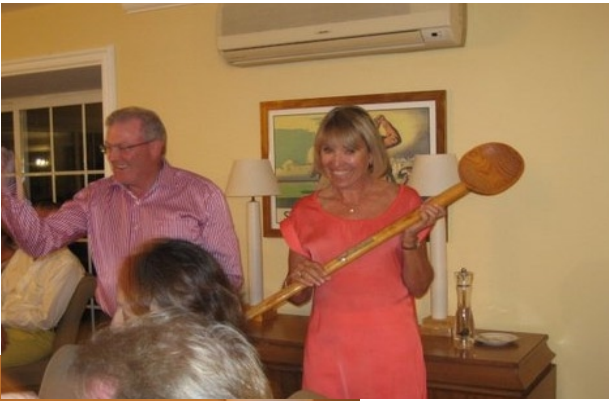
That wooden spoon again!