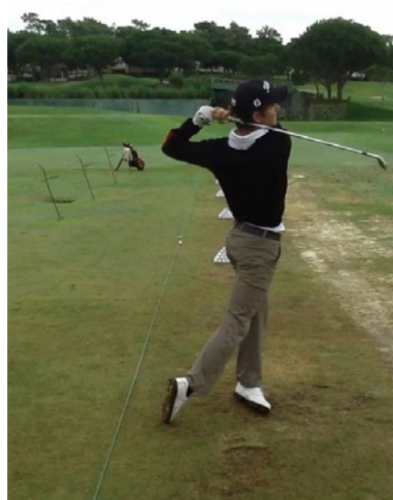
Great rotation into a complete finish producing perfect balance.