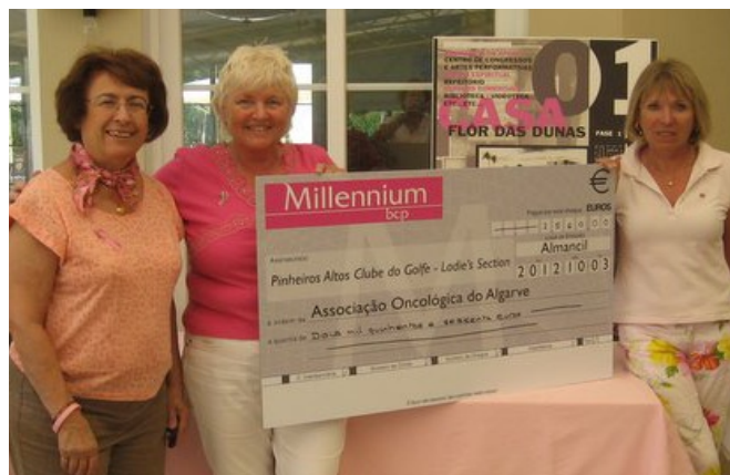
Pink Day donation