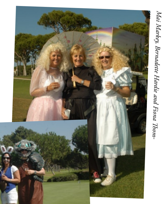
Tweedle Dum & tweedle Dee with white rabbit and cheshire cat