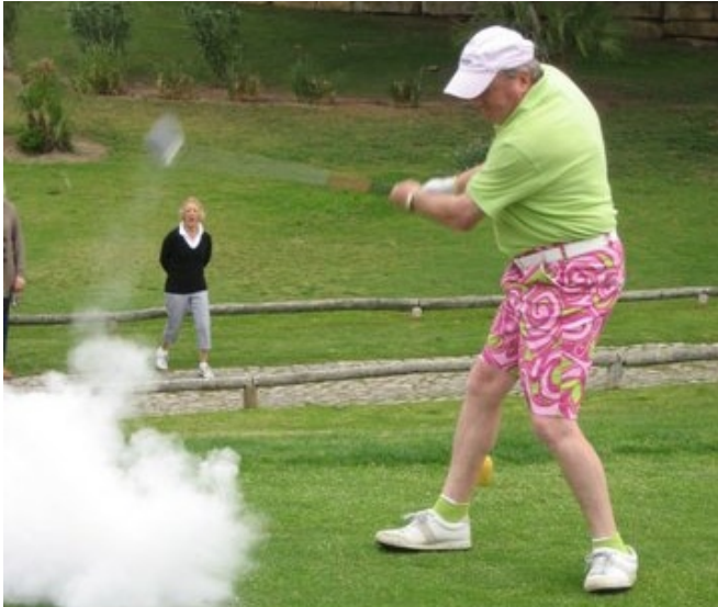
An explosive start to the Captain's year in office.