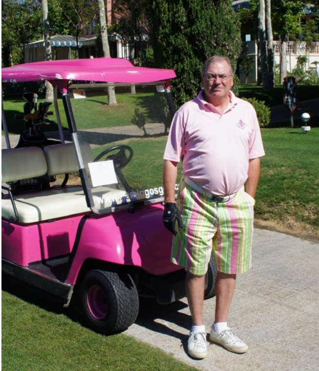
Is this really our Captain?

The course is in excellent condition and the change to the bunker positioning on the 8th Corks is almost finished, even if you don't agree with the change! All the fairways have now been hollow-tined and should be in pristine condition when Gala Week commences.